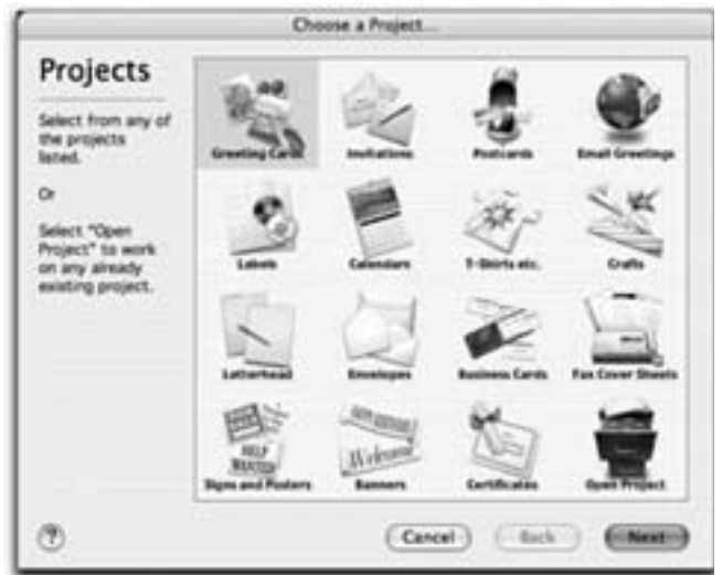
Choose a Project

Let's say you created a card for a favorite high school grad and going off to college is next. Here's a perfect time